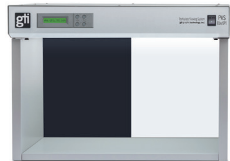
PVS-1e/SP with digital dimming option.

PVS-1e and PPVS-2e systems feature preset step dimming which is manually controlled with rocker switches. The PVS-1e/SP model features optional digital dimming for precisely setting any desired degree of illuminance up to 4000 lux.