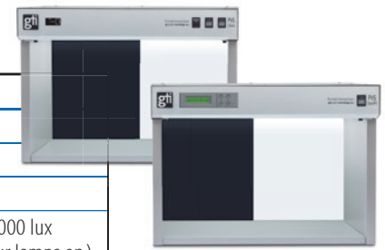
PVS-1e with manual step dimming and PVS-1e/SP with digital dimming.