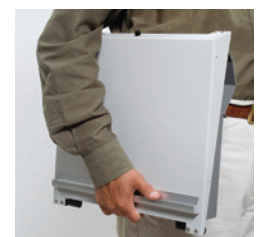
GTI's PPVS-2e model is foldable for portability and easy storage.

GTI is a leading manufacturer of tight tolerance lighting systems for critical color viewing and product inspection. An in-house spectroradiometric laboratory and a 100% measurement and verification production process guarantees that precision and accuracy is built into all products. All products are shipped with a certificate of product conformance.